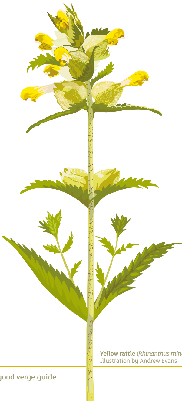
Yellow rattle ( Rhinanthus minor ) Illustration by Andrew Evans