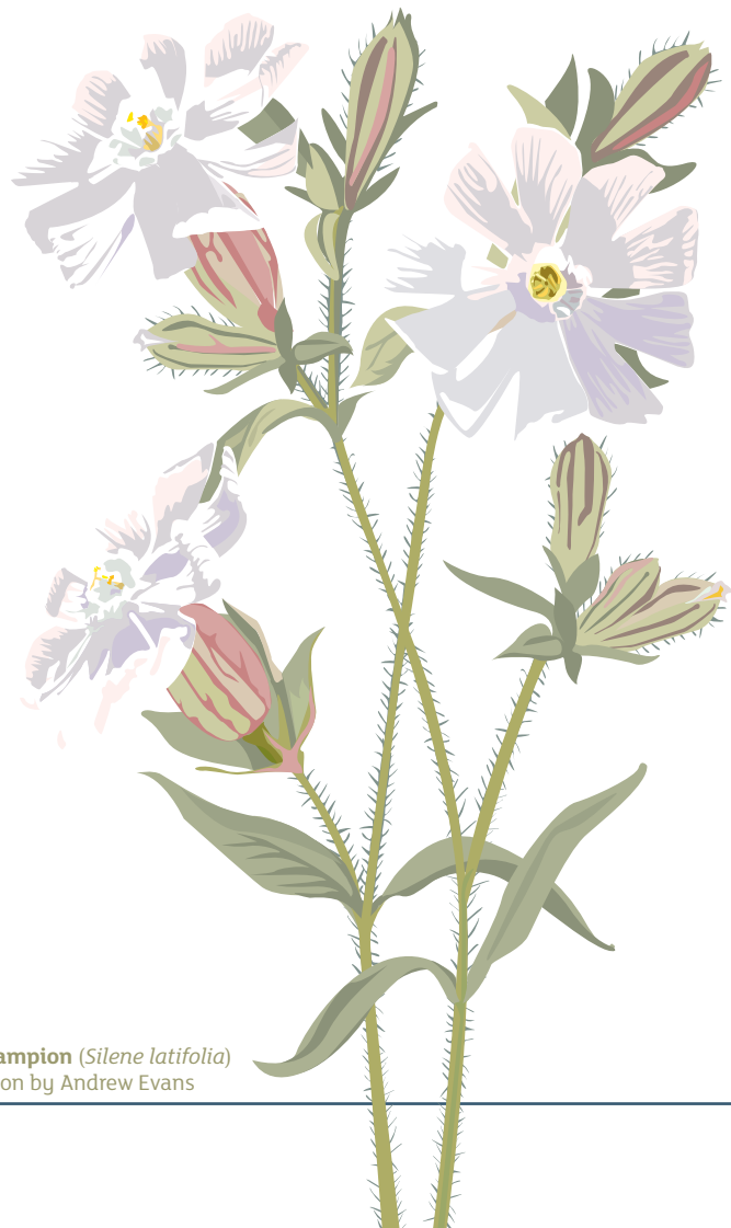
White campion ( Silene latifolia ) Illustration by Andrew Evans

While these orchids flower in early summer, like most of the 25 orchid species on our roadsides their seed pods take weeks to fully ripen. Early cutting destroys them and the hundreds of thousands of seeds they contain. As a result these orchids are now rare on verges, except those that are properly managed.